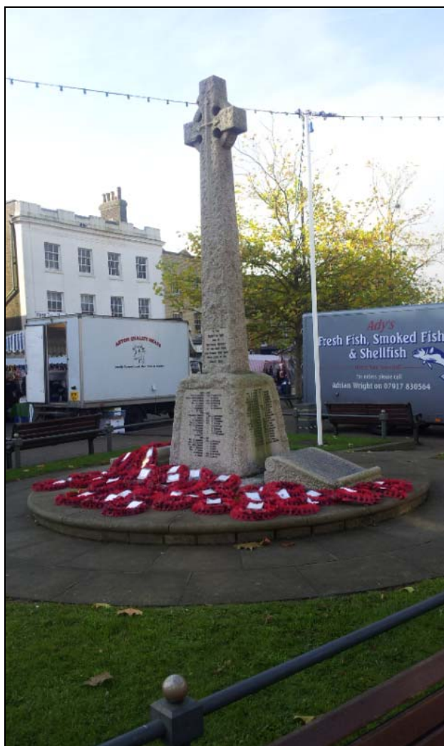
Photographed on a Saturday market day, Nov 2013.